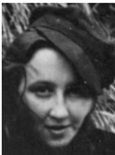
Danuta Siedzikówna "Inka", Poland (1928-1946)