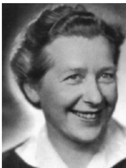
Dr. Milada Horáková, Czechoslovakia (1901-1950)