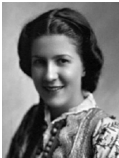
Dr. Sabiha Kasimati, Albania (1912-1951)